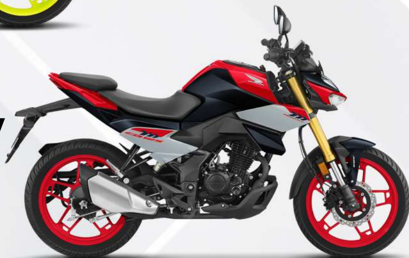
Pearl Siren Blue with Sports Red